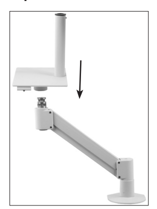
Step 2 Attach the Back Adapter to LCD Arm

Align the opening on the bottom of the back adapter with the shaft on the end of the arm.