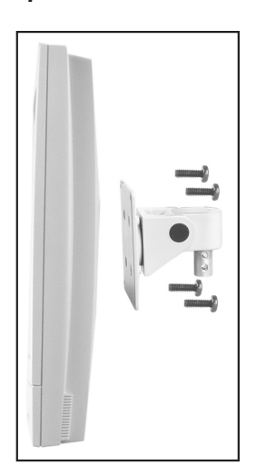
Step 3B VESA Bracket Assembly Continued

Align the tilter and VESA bracket with the hole pattern on the back of the flat panel monitor.